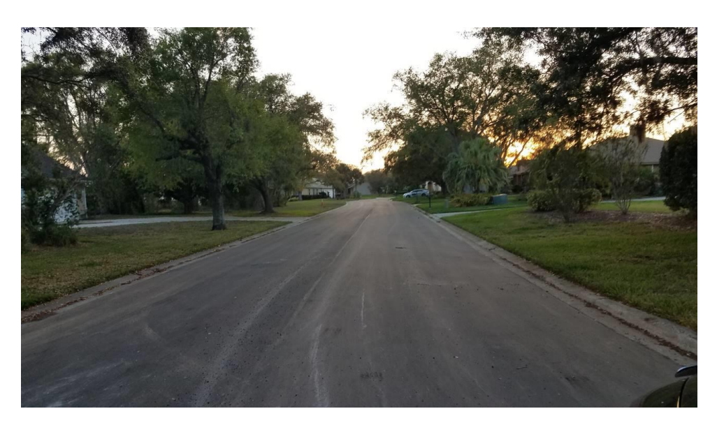
"Wherever the road takes you, Asphalt Restoration Technology Systems will be there!"

and frustration on site, I am positive I can add 50 yards minimum to my drive! He gave me a couple dozen golf balls and boy did that make me smile! I am sorry I can't remember your name but YOU ROCK!!